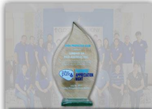
Unilever Protected Club Award