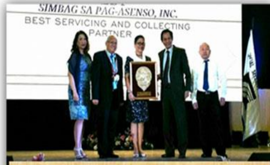
SSS Balik ng Bayan 2017