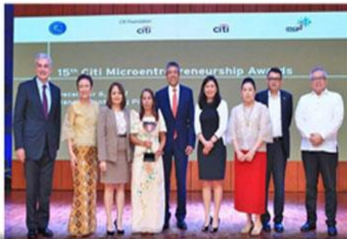
2017 Citi Microentrepreneur of the Year

The year 2017 was a year of reaping awards as SEDP received accolades and recognition from the local and national levels for its excellent service and support to noble advocacies