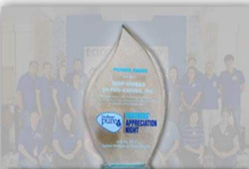
Unilever Pioneer Award