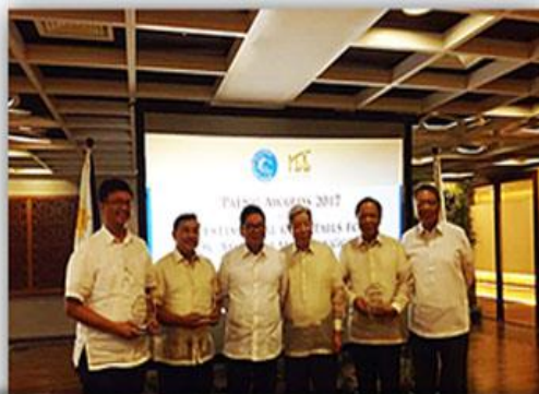
Paeng Awards for Outstanding Microfinance Institution – Innovations in Microfinance