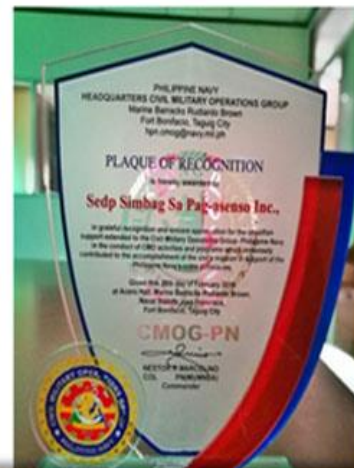
Philippine Navy Plaque of Recognition